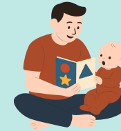
Reading to your baby