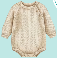
Choosing the clothes & dressing your baby