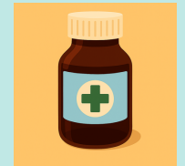
Giving medication to your baby