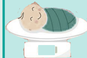
Weighing your baby