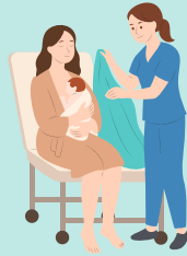
Skin to skin