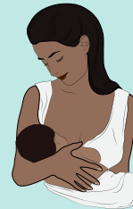
Feeding your baby