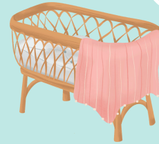
Changing & choosing your baby's bedding