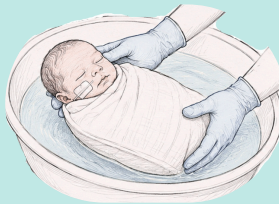
Bathing your baby