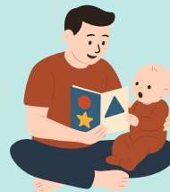
Reading to your baby