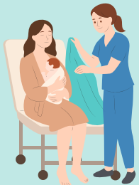
Skin to skin