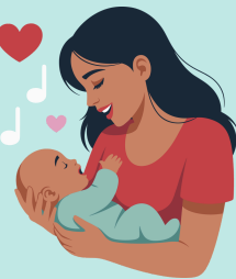
Singing and talking to your baby