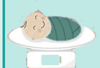
Weighing your baby