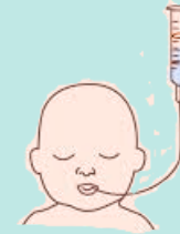
Tube feeding your baby