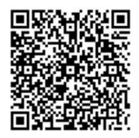
Request for teaching from the PCC ODN (Including LTV!)

We have worked hard to establish a network of LTV Champions across the region and this work is ongoing – if you know of anyone who has a background in or passion for LTV who would like to maintain their skills and knowledge and take on an educational role in their area please do encourage them to join our mailing list for information, invitations to the forums and study days and more!